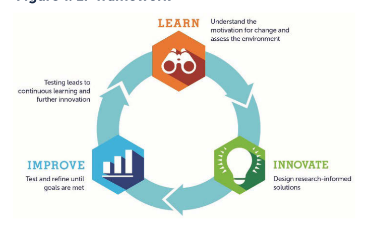
Figure 1. LI<sup>2</sup> framework

Mathematica's LI² (Learn, Innovate, Improve) framework informed the SWFI TA team's work. LI² supports a collaborative, evidence-based approach to TA so grantees are fully engaged in co-creating well defined and achievable innovations for implementing and improving their programs (Figure 1). During the Learn phase, coaches worked collaboratively and iteratively with grantees to assess needs and opportunities for improvement. During the Innovate phase, coaches developed customized grantee work plans that mapped specific resources and activities to the needs and opportunities identified during the Learn phase. Coaches developed and shared those resources and activities with